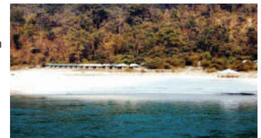
Camp River Wilds, Shivpuri, Rishikesh